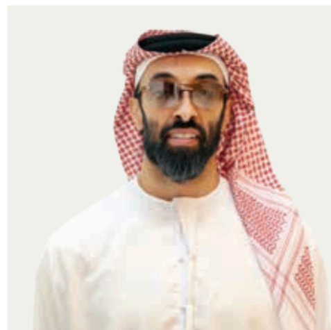
H.H. Sheikh Tahnoon Bin Zayed Al Nahyan

National Security Advisor Chairman of Royal Group