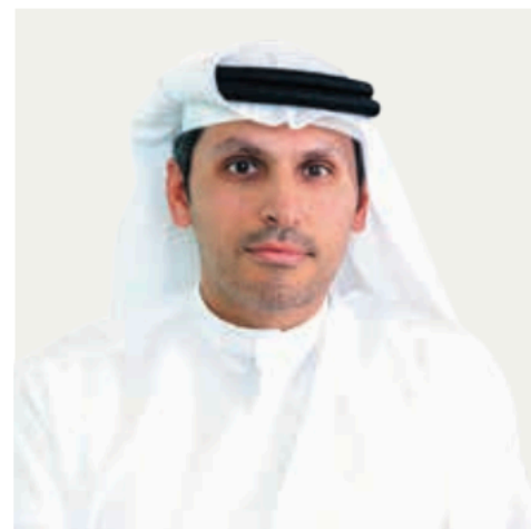
H.E. Khaldoon Khalifa Al Mubarak

CEO and MD of Mubadala Investment Company Chairman of the Executive Affairs Authority of the Government of Abu Dhabi